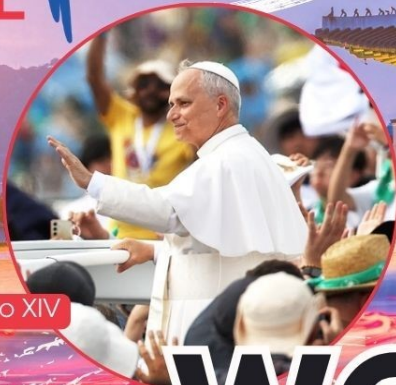
Pope Leo XIV

Packages from $5499 Includes roundtrip airfare from PBI, 4-star hotel, meals and more!