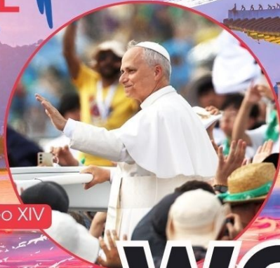
Pope Leo XIV